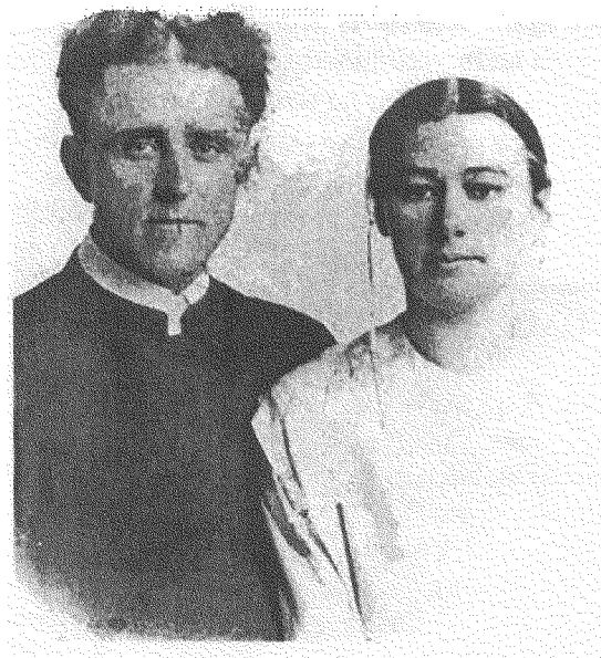
A Wedding Portrait

The outcome of this testing in later years gave him the inner strength for the founding of the Mennonite school, leading the church in Greenwood and serving the Choctaws in Mississippi, where in a spirit of adventure, he and mother made home out of a three room tenant farmer shack, without running water.